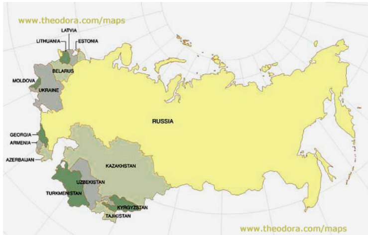
Map courtesy of www.theodora.com/maps, used with permission.